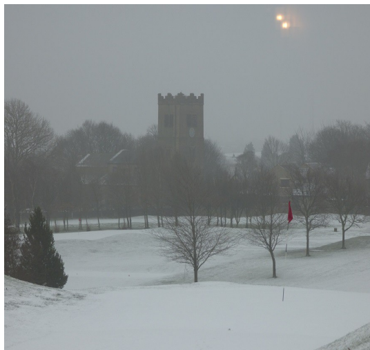
View from the Golf Club