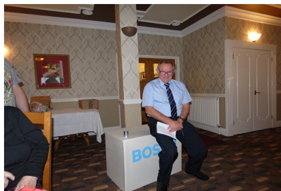
Stan's big battery

For our members who are interested in model tanks, if you are planning to build any obstacles, building etc. before commencing please can we have some costings for materials for the committee to approve. Any moneys spent will only be reimbursed with a valid receipt.