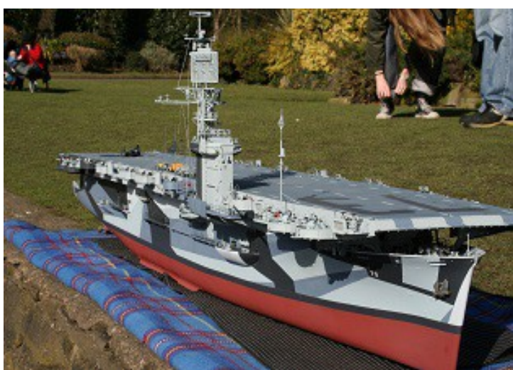
Best Naval Vessel at Blackpool S Reffin's Gambia Bay

The club returned to this show after a 22 year break. Our last visit to this show as an exhibitor was when it was held in Blackpool Tower - no we didn't dance around the ballroom! The Norbreck Hotel provides an excellent exhibition hall allowing you to drive your vehicles in which makes life easier for unloading the club's display stand and your models as well. Also easier when you are packing up on a Sunday. Thanks to Gary Dyson and Dave and Sue Barker for taking all of the club stand to the show and bringing it back to their homes. The weather was hurricane force winds with very heavy rain at times. By Sunday afternoon the wind had dropped and we had blue skies. Many thanks to the following members who attended Chris and Karen Behan, Pat and me, Dave and Sue Barker, Gary, Peter and Emily Dyson. Trade support was excellent, lots of nice models on display. Saturday, despite the terrible weather, lots of people in attendance and Sunday was also very busy. Representatives of each club were given the task of judging the best models in each class. I was fortunate enough to be awarded best naval vessel with my aircraft carrier Gambier Bay. I have sent the booking form in for next year already. A show to look forward to in the coming year.