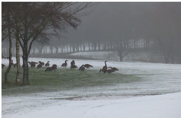
Not on the menu