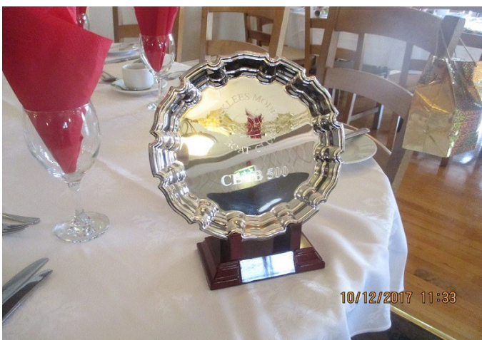
New Club 500 trophy