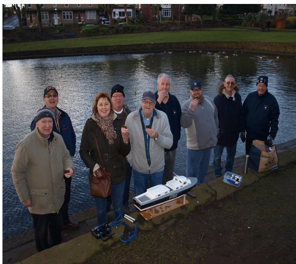
Various members enjoying Christmas fuddle