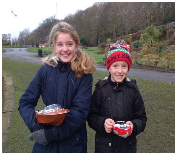
Junior member at the Park Christmas Eve