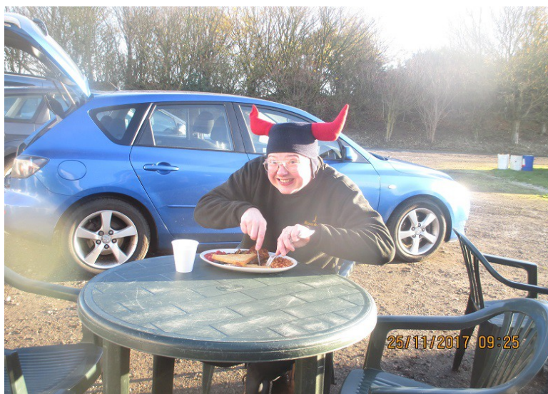
A trader having breakfast