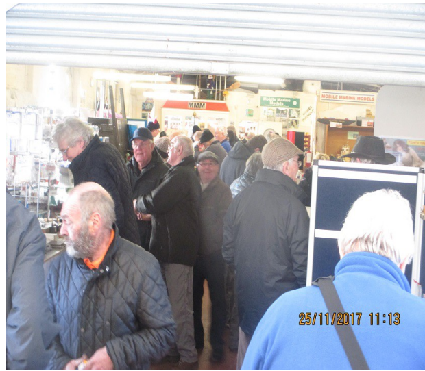
A busy morning at M Marine