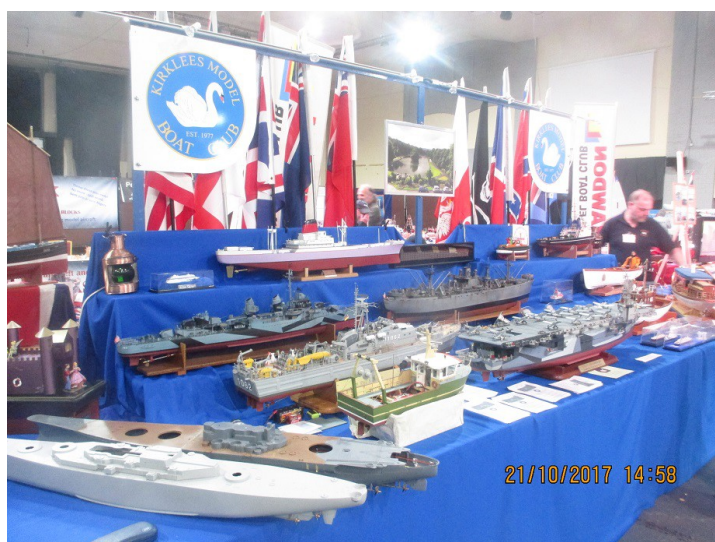
Club Stand at Blackpool