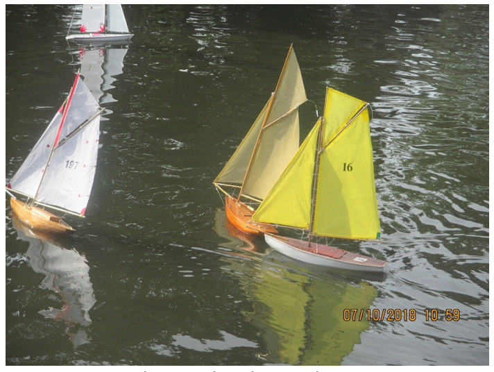
S Class yachts during the race