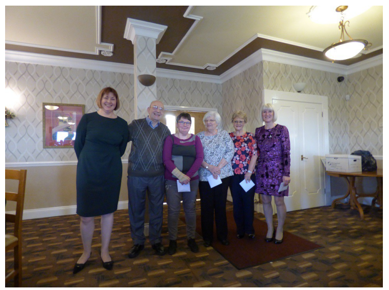
The "tea ladies and "raffle ladies" with new President