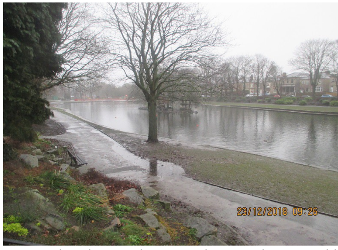
Not much sailing too busy socializing in the car park!