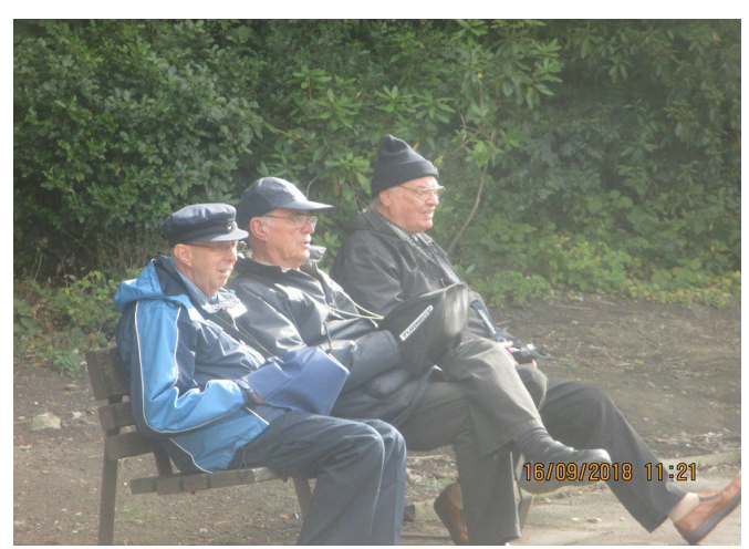
Last of the summer wine at Wilton Park

Report on final Club 500 race 23<sup>rd</sup> September by Stan Reffin – 7 club members took part in this final race on a cold dry windy day. There was a slight swell on the lake which caused a few problems. During both races numerous clashes resulting in overturned boats. A couple also collided with the start gate. Boat 9 had steering difficulties but managed to complete both races. Thanks to Stuart Smith, Terry Scarth and Baden Buckle for their help in marshalling these races. All boats were safely retrieved to fight another day! During the winter any repairs can be undertaken and we start again with a clean sheet in March 2019. The club 500 races were set up to be fun events without stringent rules and regulations and I hope this will continue to be the case in 2019.