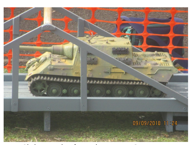
Club member's tank seen at Open Day

Report on Night Sail on Wednesday 12<sup>th</sup> September at Wilton Park by Pat Reffin - On a lovely mild evening 9 club members attended. 7 boats were on the water all very nicely illuminated. The new LED lights showed up very well as the evening got darker. Hardly any midges this year but the usual bats were flying over the lake. The sail finished around 8.45 pm. Why not come along this year and join in the fun.