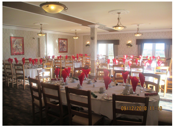
The room prior to lunch being served