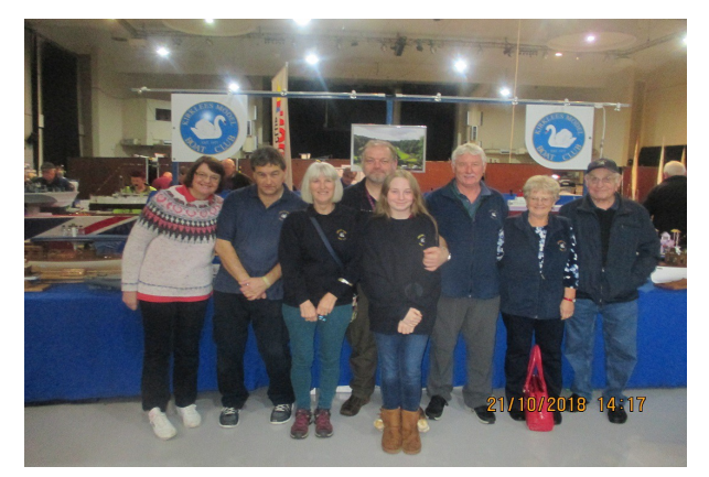
Your Blackpool display team

This was the second year we have attended this event and I can only say it has grown in popularity since last year. It is not a model boat show, it is now called a model show. This is borne out by the vast array of different types of models on display, boats, construction equipment, military vehicles, trucks, railway, fairground. Something for everyone. There was very good trade support, a large indoor pool to sail on. If you have not been to this show it is well worth a visit next year. Many thanks to Malcolm Bills for transporting the model buildings for the tank display and Chris Behan for helping out with the assembly. Thanks to Gary Dyson and Sue and Dave Barker for their help in transporting some of the display equipment and also everyone who helped with set up and taking down of the club stand, makes it so much easier. Finally I managed to be awarded 1st prize in the warship section with a model that is 20 years old my liberty ship James Blair. Let's see if I can get a hat trick next year!