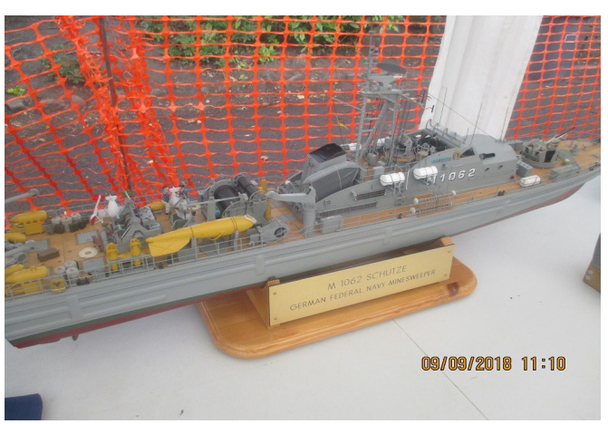
Shutze 1062 winner of Les Kirby shield