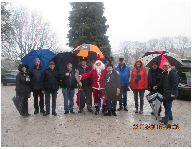
Members braving the rain for the Fuddle