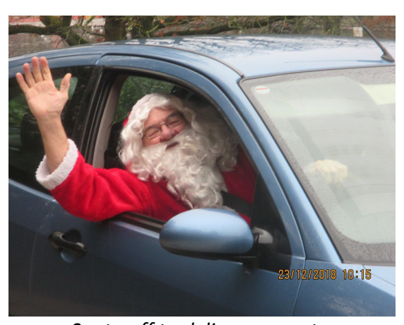
Santa off to deliver presents