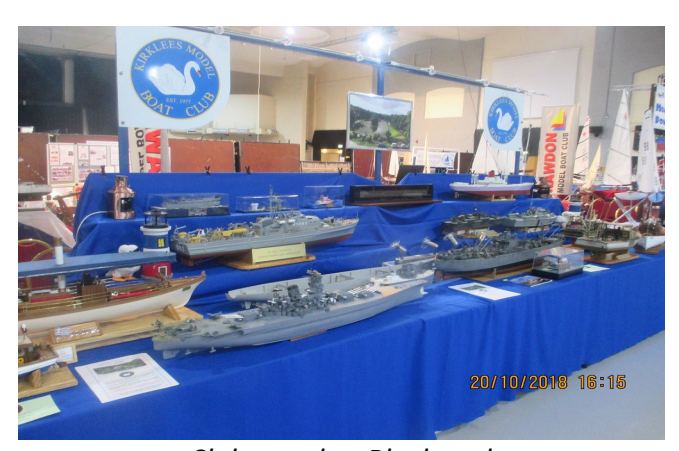
Club stand at Blackpool