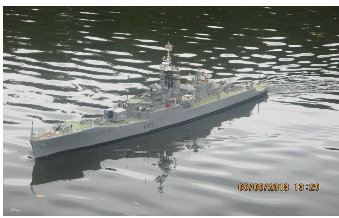
Leander class warship seen at the Open Day