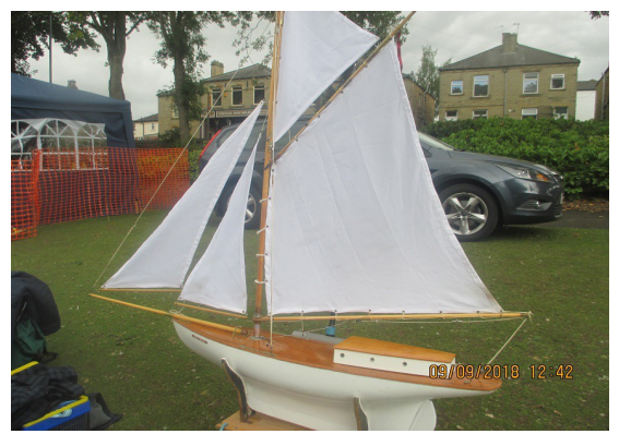
Nice sail model seen on the day