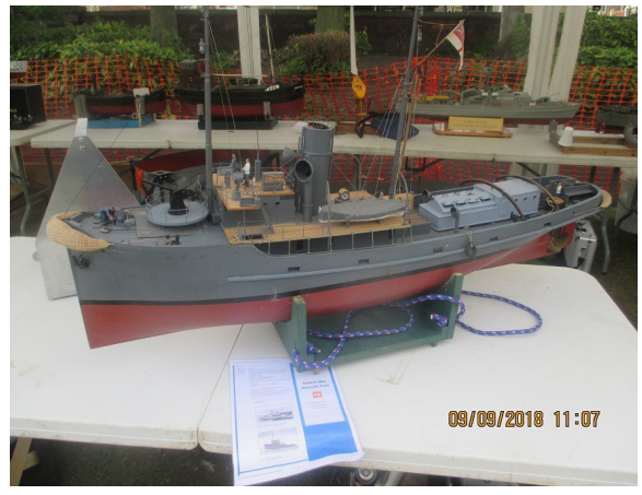
Steam powered tua seen at Open Day