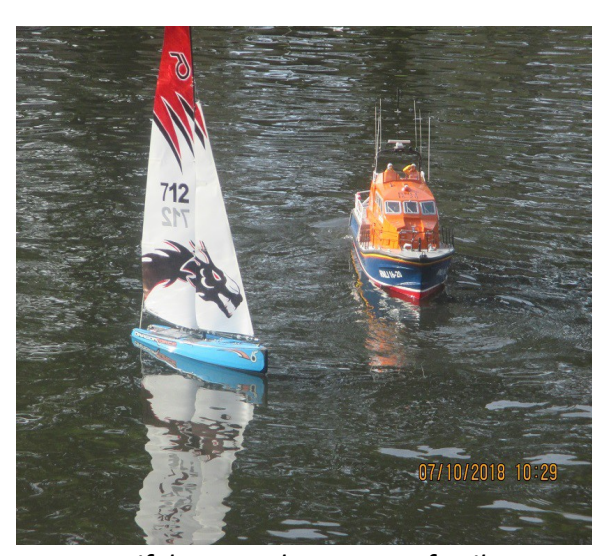
Lifeboat to the rescue of sail