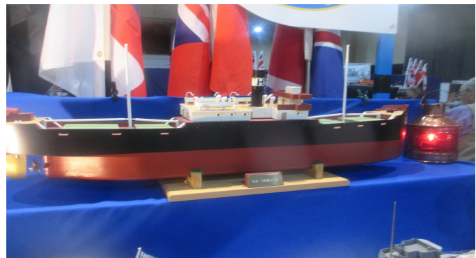
Peter Dyson's new project

Update to the smoke damage on the container 2 nd November – some may not be aware that the contents of the container have suffered severe smoke damage due to an external fire near the container, resulting in