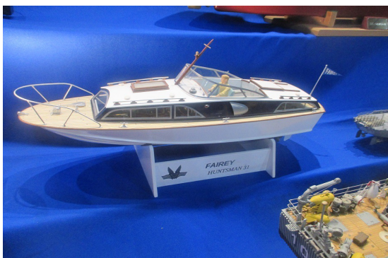
A nice model by Don Shaw

Report on Blackpool Model Boat Show 19 th and 20 th October by Stan Reffin – 11 club members attended this well organized show displaying model boats of all types and also military vehicles. Trade support was excellent and some fantastic model boats were on display along with some fairground models. In the ballroom could be found some very good military vehicles trucks and construction equipment. The tank display area was very good and the buildings provided by KMBC members made all the difference. The for sale section was very popular with all sorts of items for sale. A small pool was provided for model boat sailing which was well used throughout the weekend. This show seems to get better every year and it is one to put on your calendar for next year. 17 th and 18 th October 2020 is a provisional date but may be subject to change.