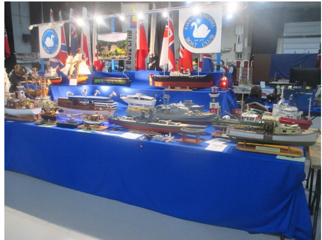
Club stand at Blackpool Show