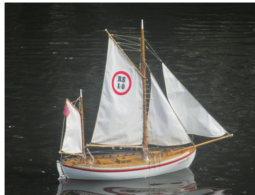
Colin Archer sail boat