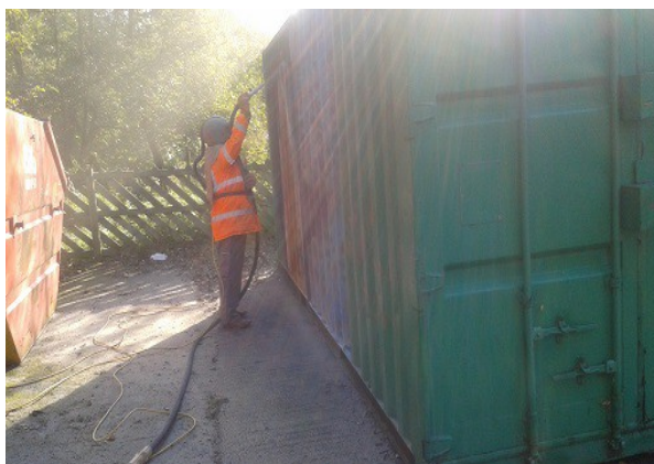
Sand blasting the shed

As a club, and as individuals, we have always striven to ensure that our activities were and are a significant asset that brings interest and added pleasure to all members of the general public who come to enjoy the parks facilities, and we believe that this continues to be the case. However, we wish to issue a general reminder to members that, despite our long association, we have no "right" to use the park facilities as a club, and are (and always have been) totally dependent on the continuing good will of the park authorities who kindly grant us permission to operate. I believe from my own research that there is no other suitable facility available within thirty miles that could enable us to enjoy the hobby that brings so much pleasure, interest and companionship to our two hundred plus members. Without it the club could not exist. So let us never forget these facts, and let us seek to ensure that we individually, and as a group, continue to show every courtesy, co-operation, and good will to park staff, Council representatives, and members of the public, etc, and maintain the clubs position as a welcome asset to Wilton Park.