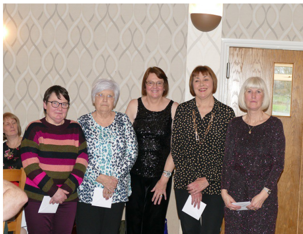
Our caterers and one of the raffle team