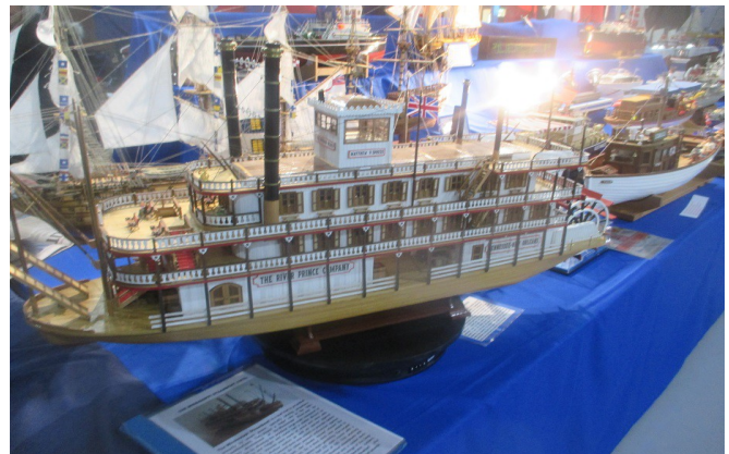
Lionel Broadbent's Stern Wheeler

Report on Blackpool Model Boat Show 19 th and 20 th October by Stan Reffin – 11 club members attended this well organized show displaying model boats of all types and also military vehicles. Trade support was excellent and some fantastic model boats were on display along with some fairground models. In the ballroom could be found some very good military vehicles trucks and construction equipment. The tank display area was very good and the buildings provided by KMBC members made all the difference. The for sale section was very popular with all sorts of items for sale. A small pool was provided for model boat sailing which was well used throughout the weekend. This show seems to get better every year and it is one to put on your calendar for next year. 17 th and 18 th October 2020 is a provisional date but may be subject to change.