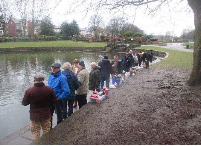
Early morning members enjoying pre-Christmas get together