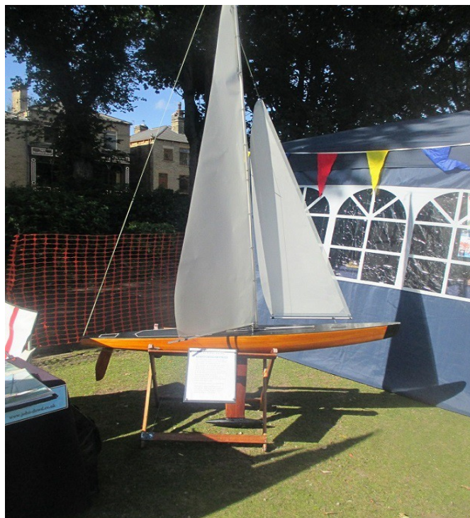
Static display of yachts