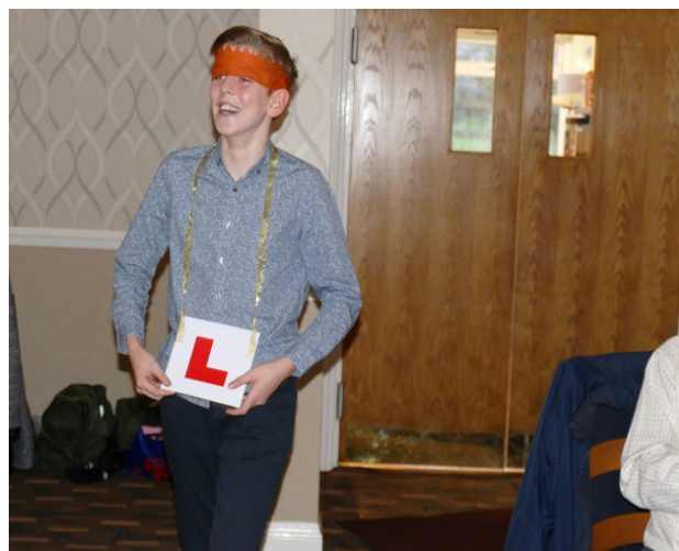
Junior members with an L plate for a beginner sailor