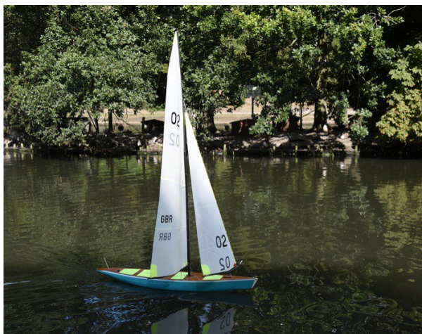
More yachts on the water