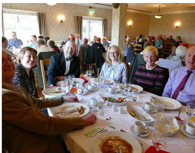
Members enjoying their Christmas lunch

REMINDER – CLUB 500s should be brought down to the Park on 9 th February for checking as agreed at the AGM. Club 500 members will be contacted if this arrangements needs to change.