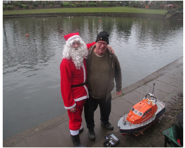
Thank you Santa I always wanted a Lifeboat