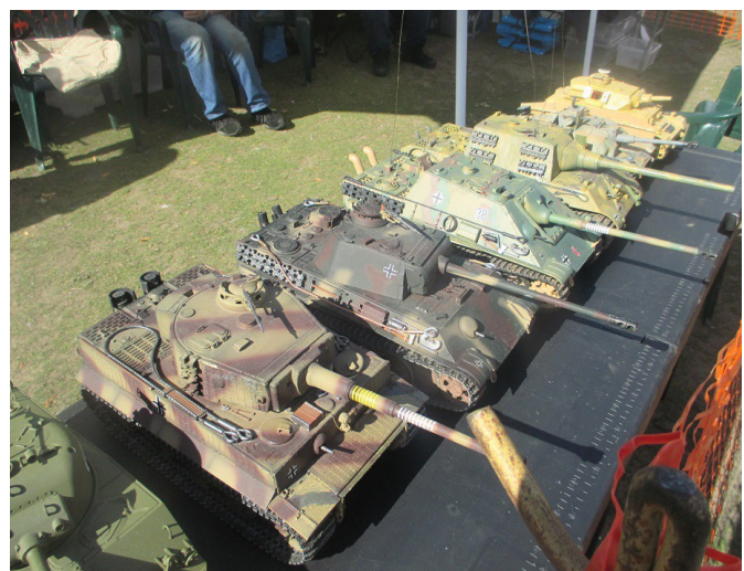
A selection of tanks