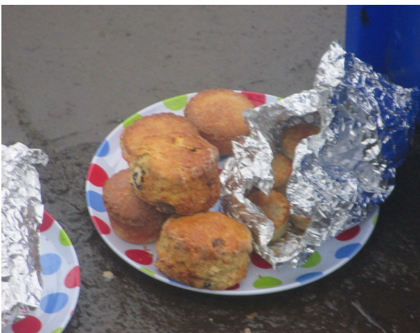
Some of the food donated by members, tasty!