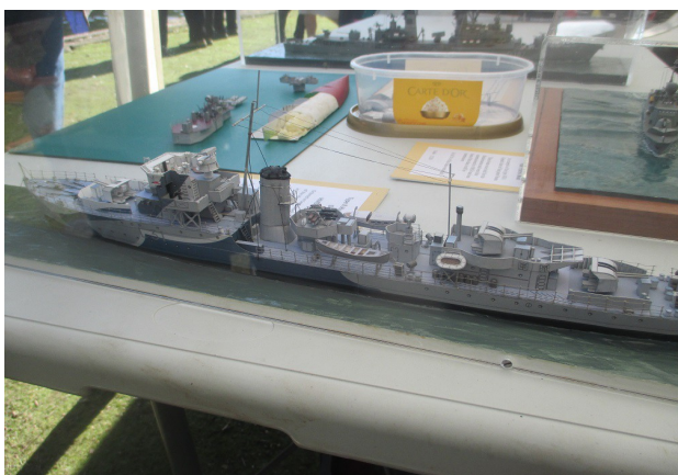
Trevor Briaas' card model