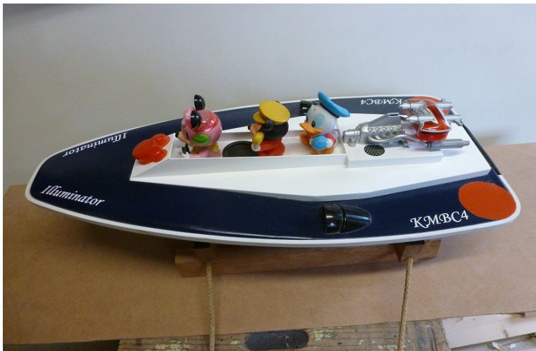
David Moss' street light model