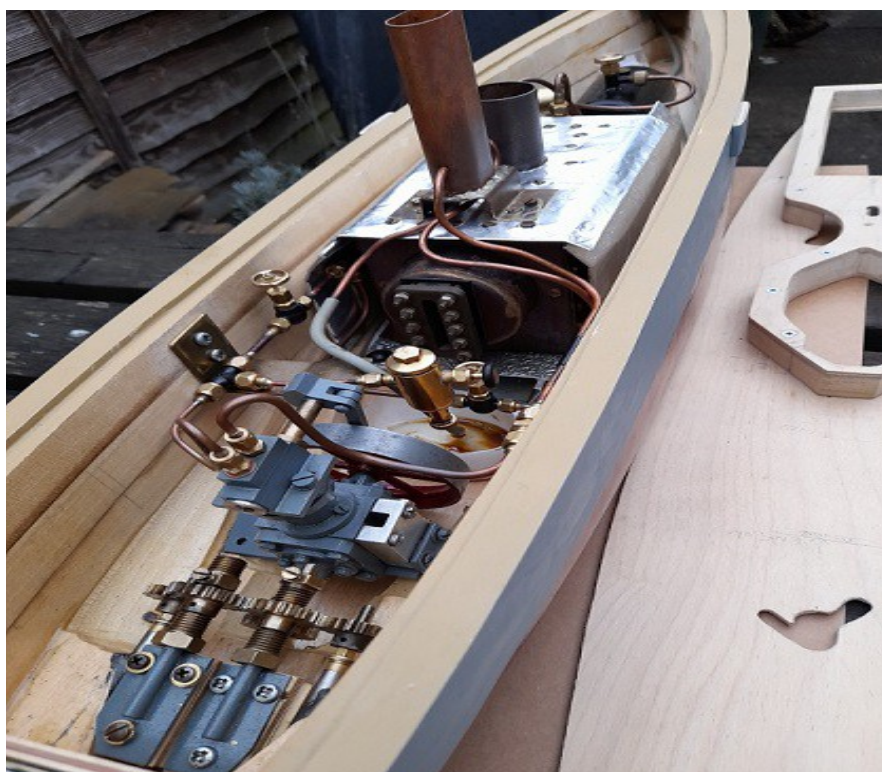
Steam plant fitted in Graham's Dreadnought