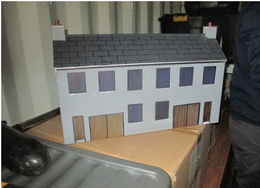
New dockside building made by Andrew Egglestone