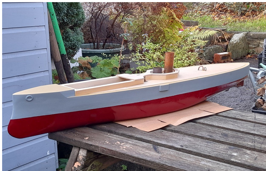
Graham Smith's Dreadnought

As soon as I am happy with the steam plant, I will try it out on the water. However, I have still to complete the superstructure and deck fittings, but successful operation will spur me on to completing the model.