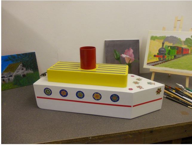
Jack Stanley's latest model (will it float?)