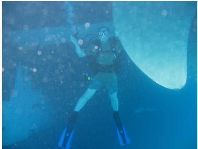
Guess who is in these pictures? Not at Wilton Park