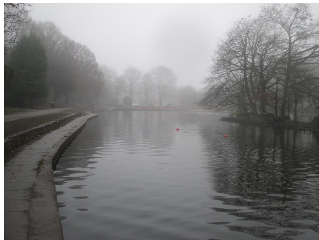
19th December a wintry Wilton Park lake