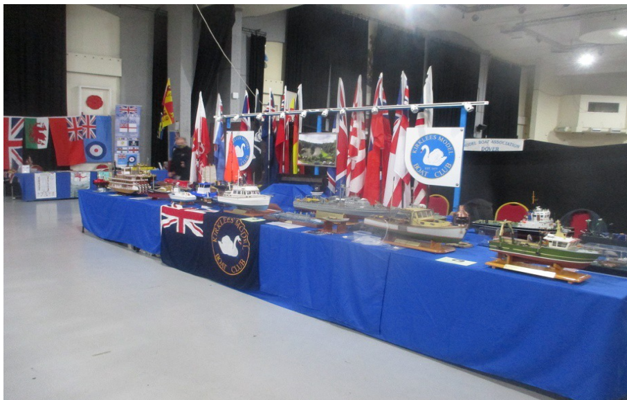
Club stand at Blackpool Show October 2021 with lower light unit