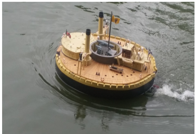
Lionel Broadbent's winning model at Blackpool