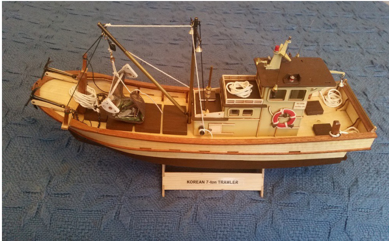
Lionel Broadbent's latest model a Korean Trawler