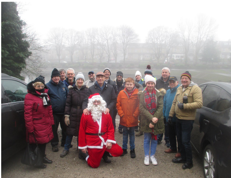
Members enjoying the Christmas Fuddle in the cold fog