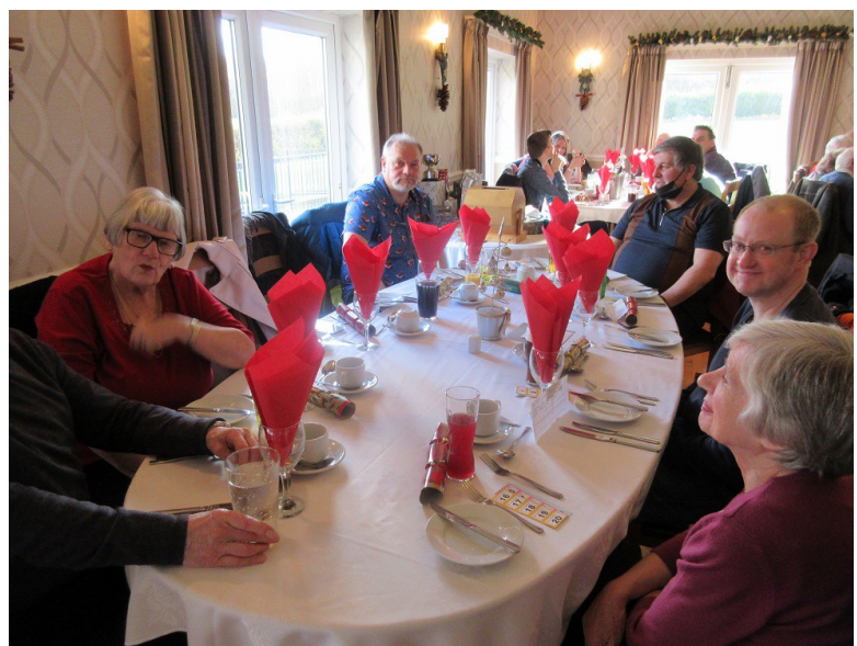
Members waiting to start their Christmas lunch - very nice it was too