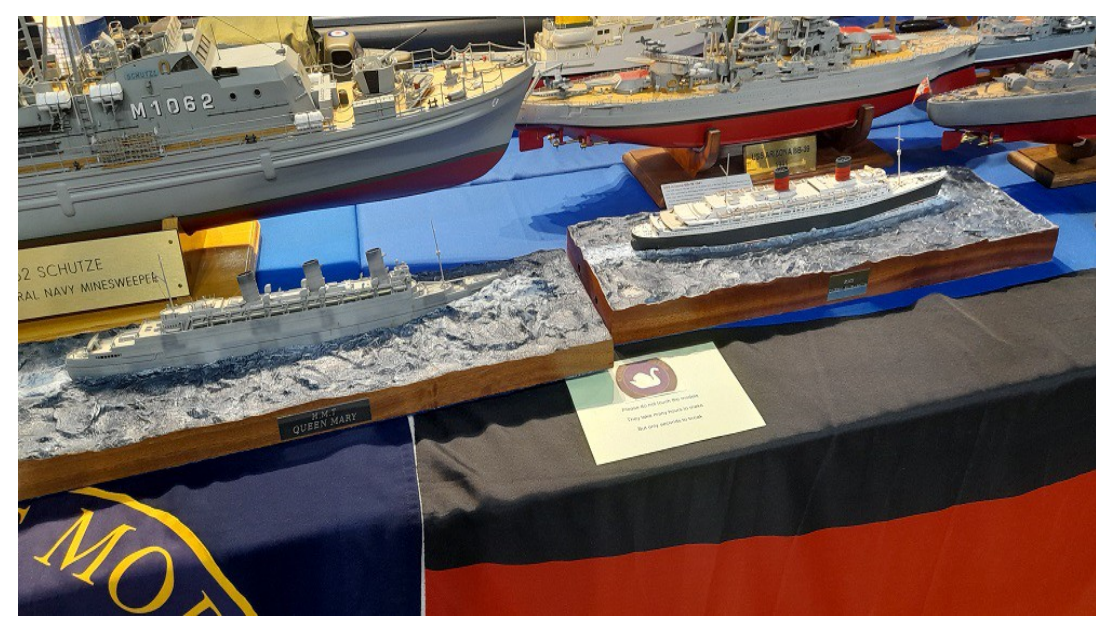
Gary Dyson's 2 dioramas