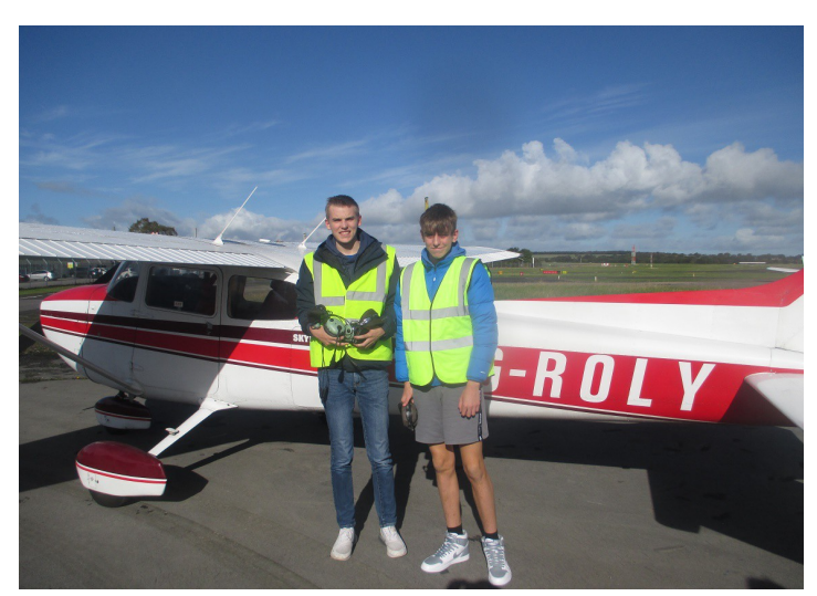
Two very happy young men after the flight

Away from the park 8<sup>th</sup> October found me at Leeds Bradford Airport for a one hour flight with my grandsons leaving Leeds Bradford we flew over Harrogate, Knaresborough and headed out towards Middlesmoor returning by Harewood House to Leeds.