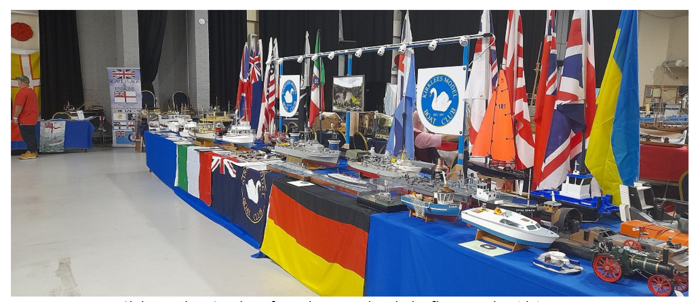
Club stand on Sunday after a busy weekend, the flags need a tidying up

Blackpool Model Show 15<sup>th</sup> and 16<sup>th</sup> October – This year we had club members displaying model boats on a 30' stand. We also had individual club member Chris Behan displaying military vehicles and David Barker displaying a range of robotic dioramas, very clever! On the main club stand Stan had a demonstration board showing various electronic installations for use in model boats. This attracted a lot of attention from other modellers. There were various model boats on display of different scales. The show was well attended on both days, lots of other club attended from as far afield as Dover. Trade support was good the bring and buy area was a bit small and new for this year a very large rock crawling area. In total we had 14 members who took part over the weekend and several others visited the stand. Sadly no awards this year. This show is definitely on again in 2023, the same weekend as this year.