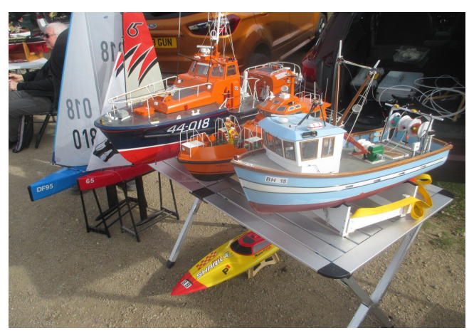
Some of the models of Manvers' members