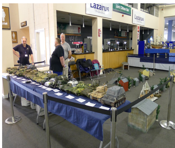
Our military members