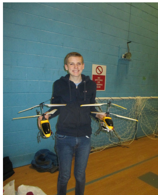
Can I fly them both together?