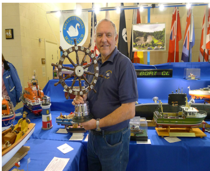
Best club stand trophy