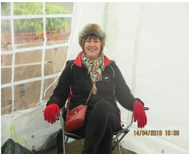
I was told it was going to be warm!