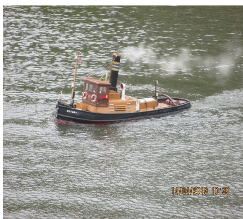
Steam tug from Etherow MBC