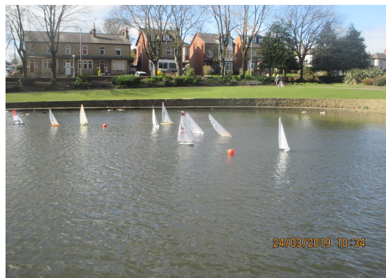
Yachts in the March Hare

Report on Island Endurance Event 7 th April 2019 by Stan Reffin - With revised rules in place 12 scale and semi-scale models took part in this event. We had a gentle breeze blowing down the lake which caused no problems with rough water. I am pleased to say we had no problems with models catching fire or sinking although one member's motor mount actually melted due to a very hot motor. Model sizes