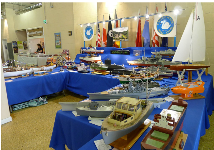
Club stand at the ME