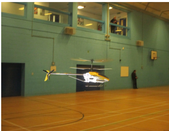
Helicopter in flight