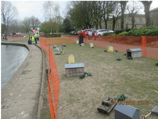
Military Vehicle display area