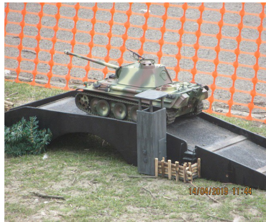
German Panther crossing bridge