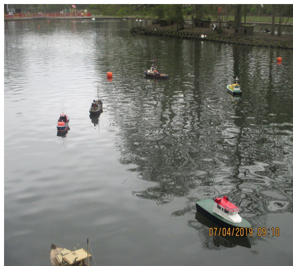
Some models getting ready for the start