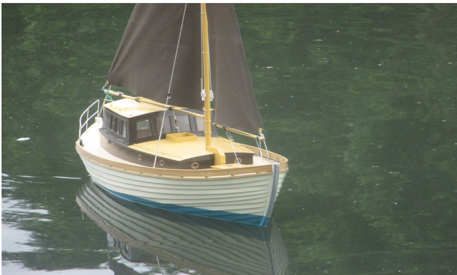
Jack Stanley's motorized yacht on 10 th June 2021