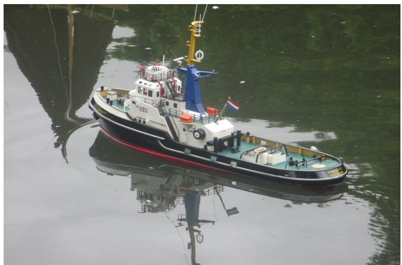
Ian Underwood's fine tug model at Wilton Park 10.06.21

We have included some pictures showing members back sailing at Wilton Park. It feels safe in the Park and everyone socially distances. Please come down on a Thursday afternoon or Sunday morning.