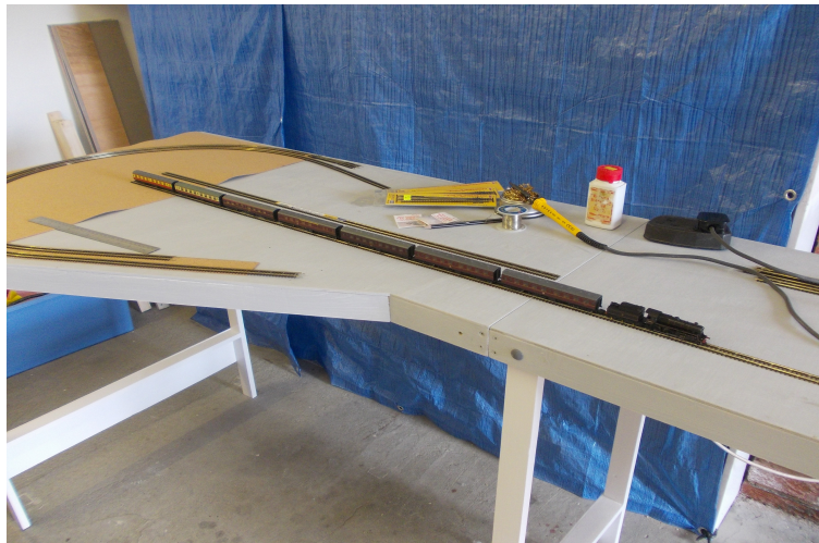
Jack Stanley's new railway layout, still a long way to go