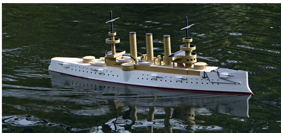
A fine model by Jack Stanley