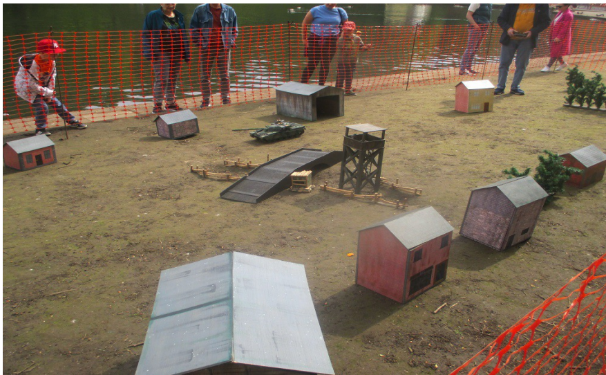
Tank display area