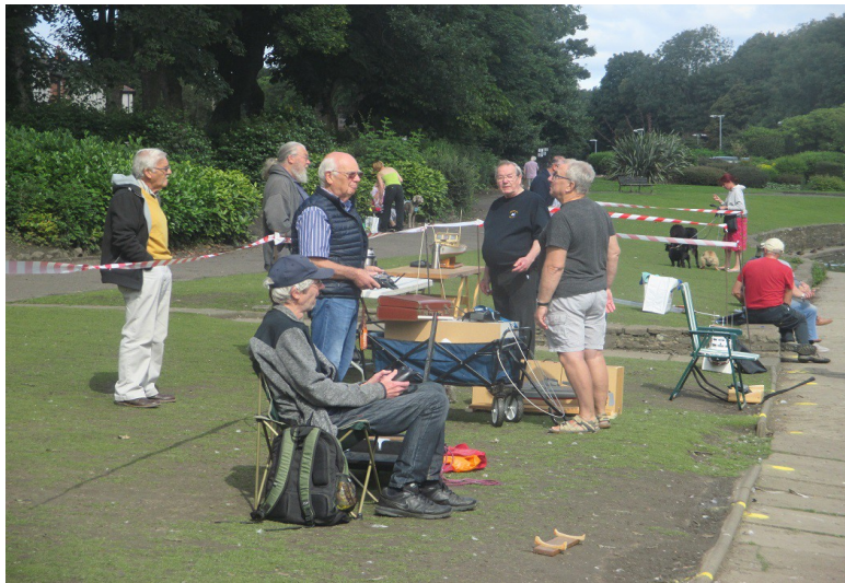
July 2020 some members having a sail during a break of the restrictions