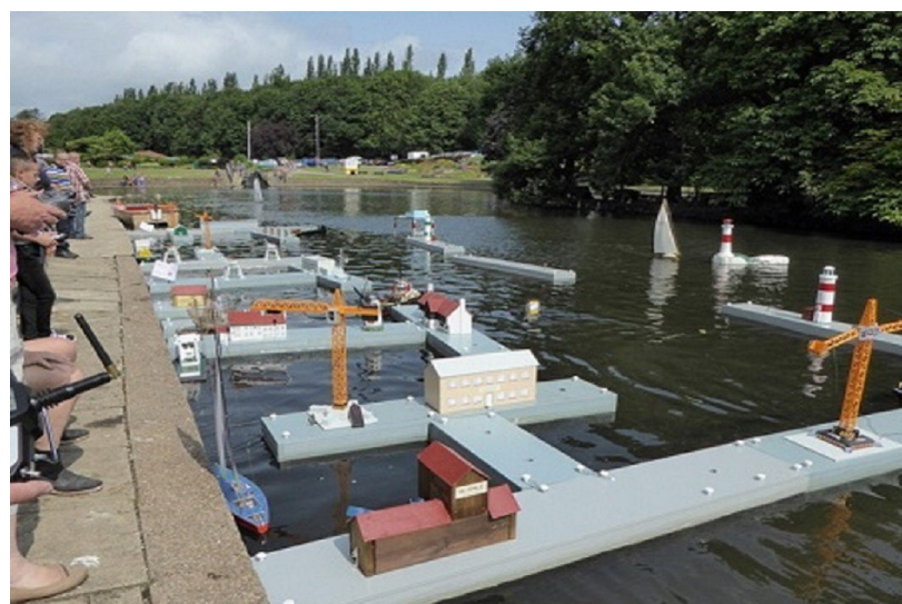
Open Day July 2015