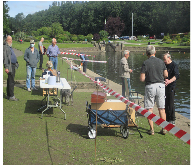
July 2020 one of our first meetings on a Sunday