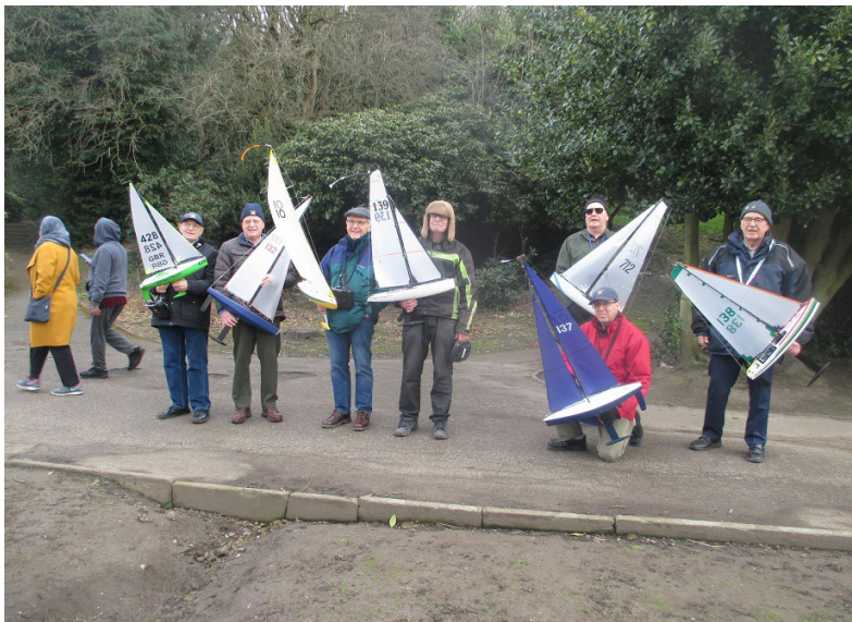
We are sailing! Club members before the start