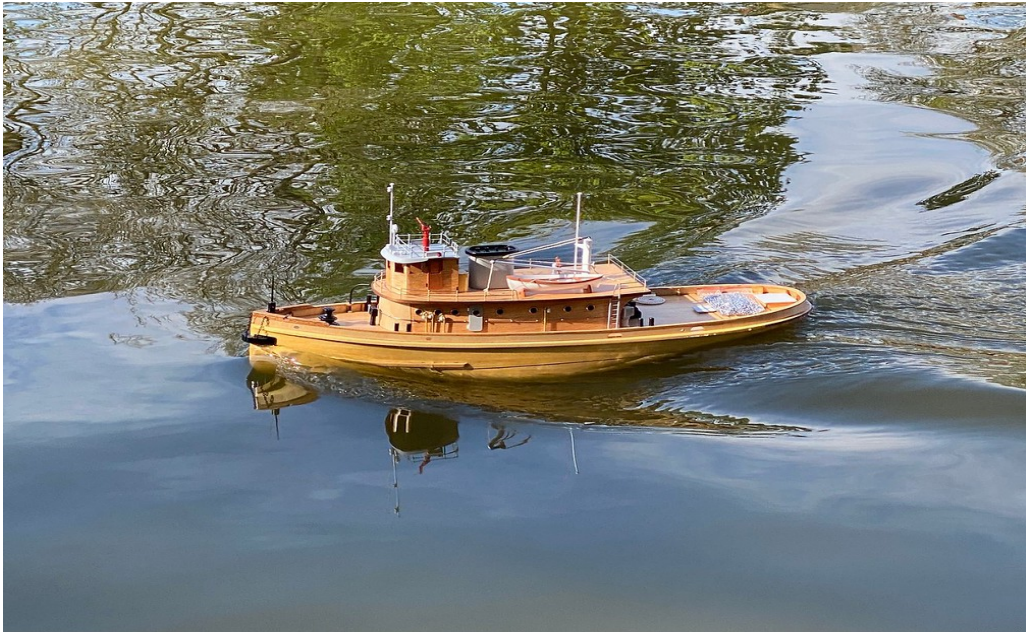
Andy Waters' fine example of the Billings Hoga Tug left in natural wood finish