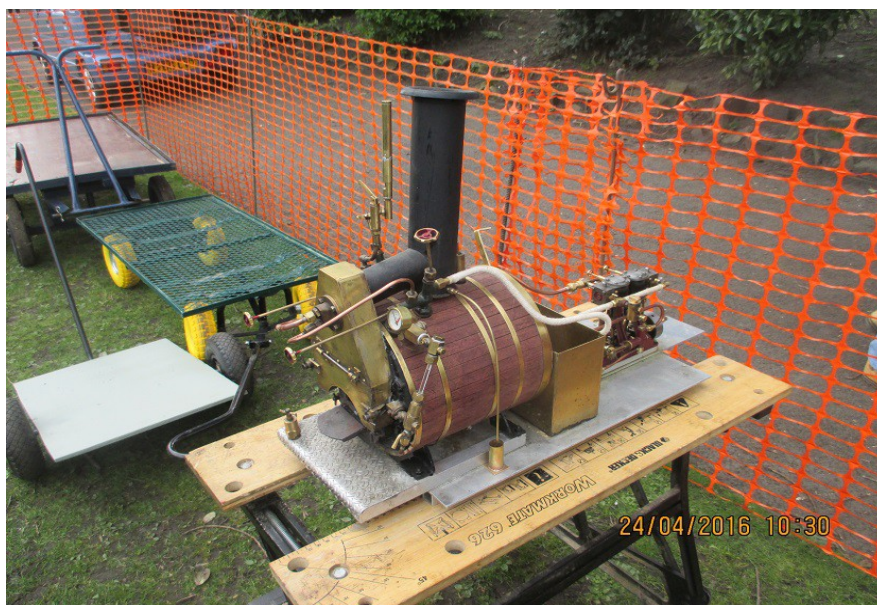
Unusual coal fired steam plant, Steam Day 2015