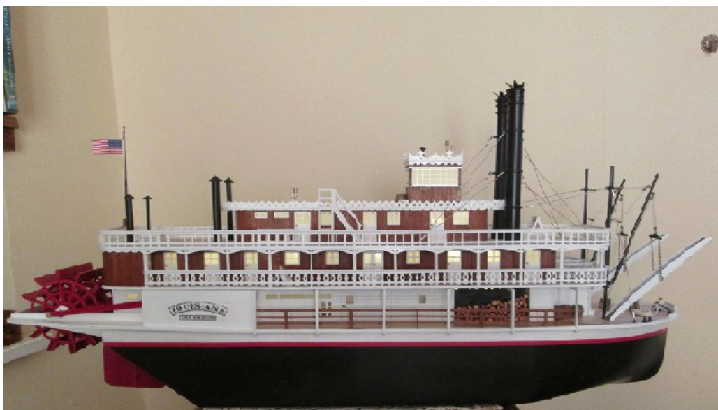
Nice model Alan look forward to seeing it at Wilton Park

What have members been doing recently, let's have a look. A Mississippi Steam Stern Paddle Wheeler circa 1890 By Alan Oldfield (except my model is electric driven and built in 2021) The model is built mainly of polystyrene, flat bottomed and plank on frame with individual wood deck planks. The decoration round the wheel house features the fleur del-ise, which is the emblem of New Orleans and of Wakefield. I had difficulty in making the finished boat stable in water with the original plan hull depth, in fact it tipped over even with the motor and gearbox and the batteries on the bottom plate. Back to the drawing board and a new deeper hull was made with plenty of ballast. How the real boats were stable and carrying loads of cotton bales on all decks is a mystery. The drive motor is a 540 with a 50 to 1 gear box linked to a crank layshaft via a timing belt. Copper clad printed circuit board makes up the paddle wheel and connecting rods. All deck saloons are illuminated with the lower front LED's acting as an indicator for the "chimney smoke" water level detector, useful when filling up. The "smoke" has two outputs, low when the boat is stationery, and high when in motion. An MP3 player provides engine sound and honky tonk piano music.