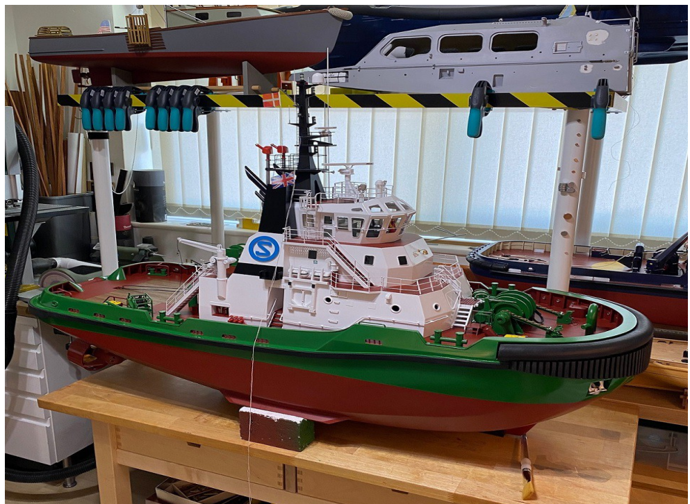
Andy Waters' latest tug model, very large and heavy. If this appears on Island Endurance Day this could be a winner!