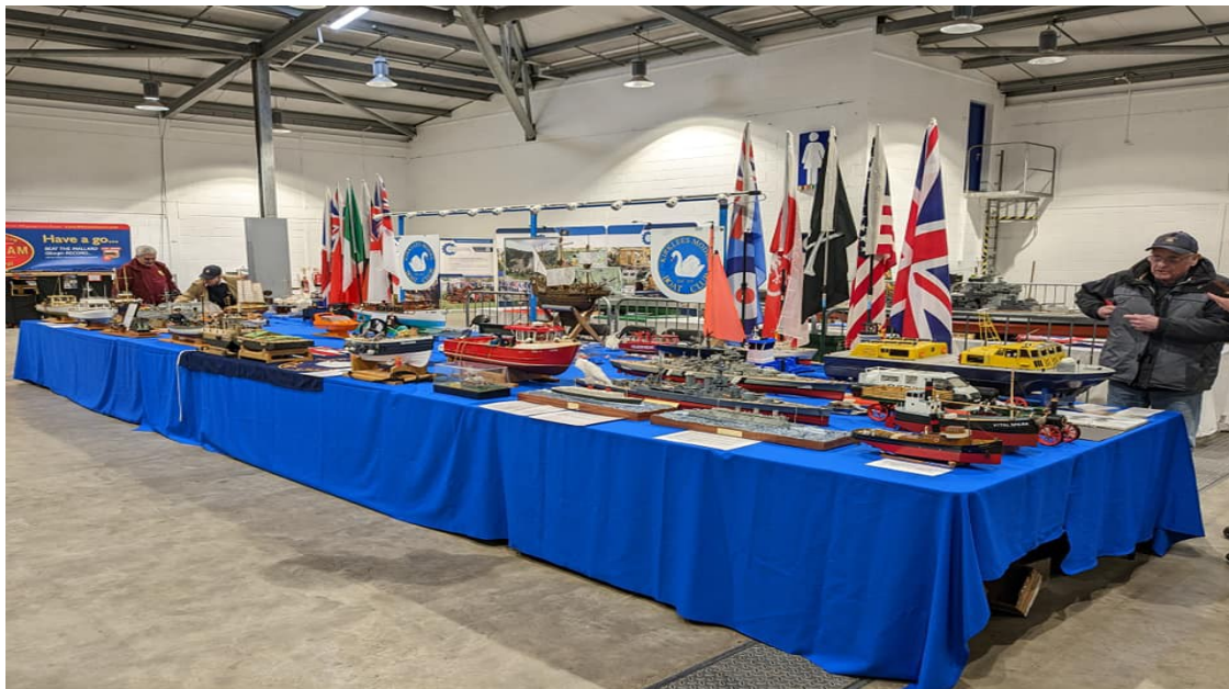
Club stand which was 30' long x 5' wide 40 plus models on display