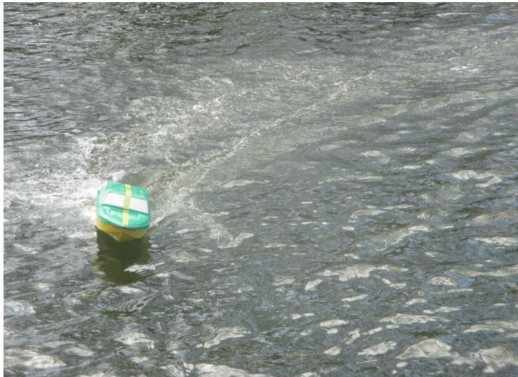
Lerry Sneire's Club 500

Small Rescue Boat/Dinghy - The Club Rules state specifically when using this boat prior to launching and recovery two club members must hold the boat at the bow and stern for people getting in and getting out. YOU MUST wear a buoyancy aid. Finally a cable will now be attached to this boat. The reason for this is should the person rowing the boat suffer an injury, it means we can then pull in the dinghy by hand. This will be the case in future rescues. Row out to the problem and then be pulled back in.