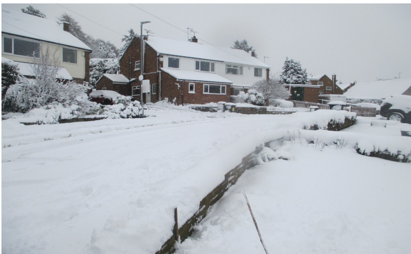
This is what greeted us on Friday morning before setting off.

After many years of being at Doncaster, this Show has gone full circle and come back to its original home under a new title. A brand new building to replace the old Flower Hall. This new hall was full of model railways, traders, traction engines. There was one massive railway layout that took two days to assemble. In the other hall model boat clubs, military vehicles, model engineers and various traders. On Thursday the setup day we had wet snow all day but this didn't deter people from arriving to set up. On Friday morning, after digging out of our driveway and clearing the street, we arrived an hour later than planned in Harrogate. Friday saw a steady stream of visitors, Saturday was an exceptionally busy all day. Lots of interest on the Club stand, members of the public showing an interest in all items on display. Sadly no competitions this year or programmes detailing what was on site. These details have been fed back to the organisers who have said they will look at this for next year. Hopefully the show will be on next year in May. Thanks to everyone who helped set up and then dismantle the club stand. Chris Behan and Gary Dyson provided an excellent display of military vehicles. Sadly we should have had more model tanks and display items there but due to the bad weather some club members could not make it.