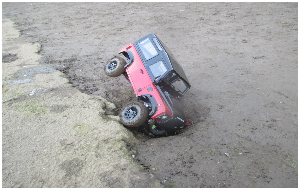
Learn how to drive at the Kirklees MBC Driving School

Steam Day - 14 th May 2023 8 am start - Help will be needed to remove items from the container, erect tents and fencing. Items are needed for sale in the catering tent. Sandwiches, cakes, buns, biscuits, sausage rolls etc. etc. Everything must be wrapped and labelled. We could have a small raffle if anyone has any items to donate. Please let Stan know if you have either by email or down at the lakeside.