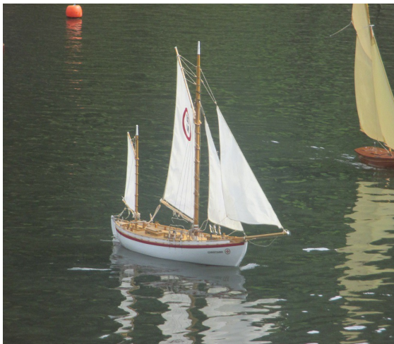
Nice sail model seen at the Open Day