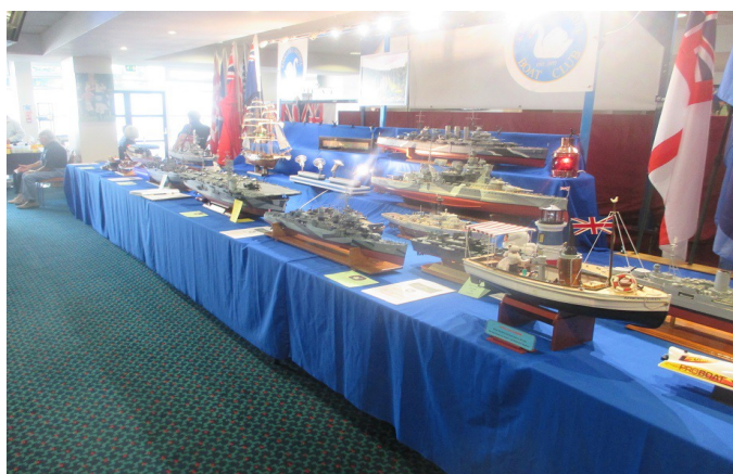
Club stand at Haydock