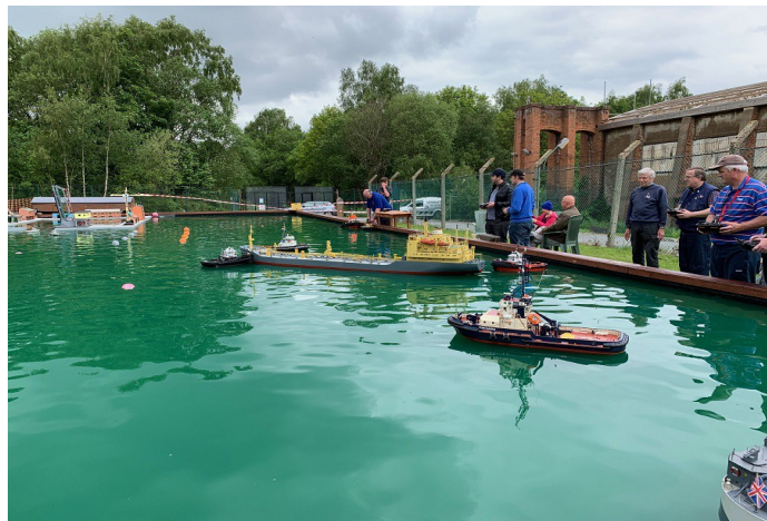
Sailing area at Hooton Park