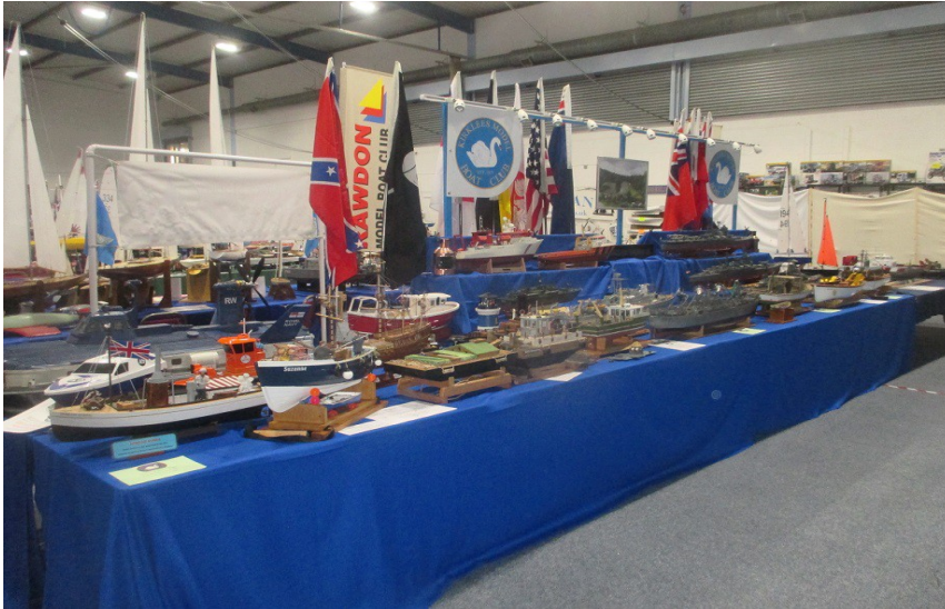
Club stand at CADMA Show