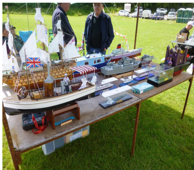
Display at Heath Rugby Club