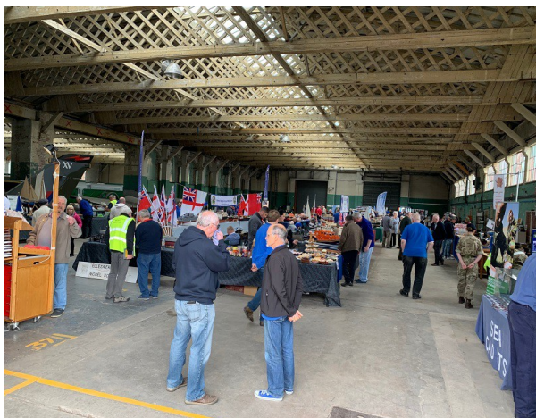
View of the main hall at Hooton Park