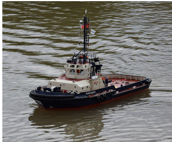
Andy Water tug Portgarth an excellent example