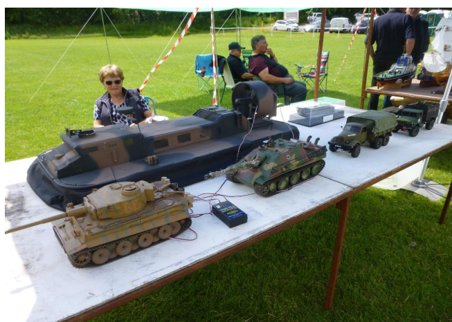
Military vehicle display at Heath Rugby Club