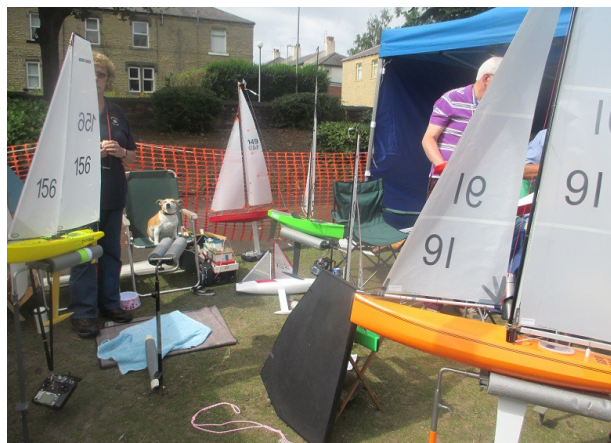
Colourful yachts on display