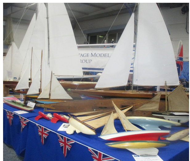
Vintage Model Yachts on display