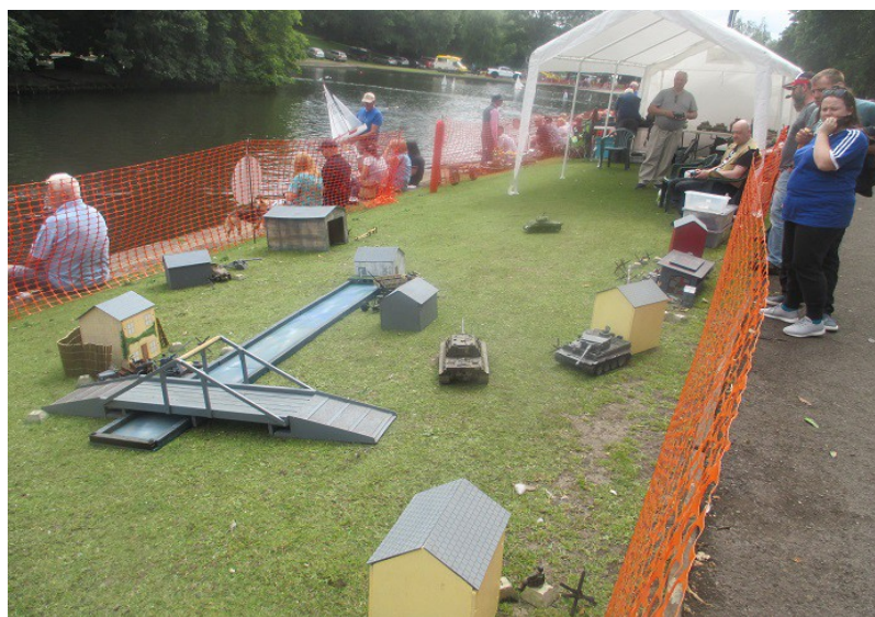
Model tanks on display