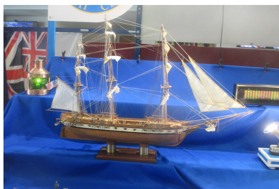
Lionel Broadbent's rigged & sail at Haydock