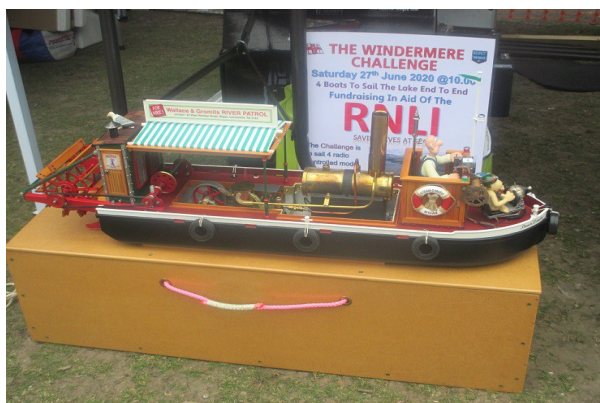
Yes it is steam powered