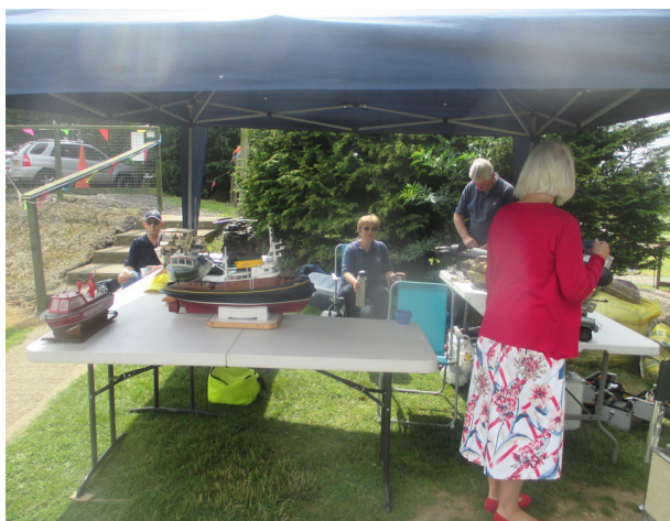
KMBC tent at Bridlington