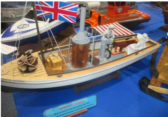
Lionel Broadbent's African Queen