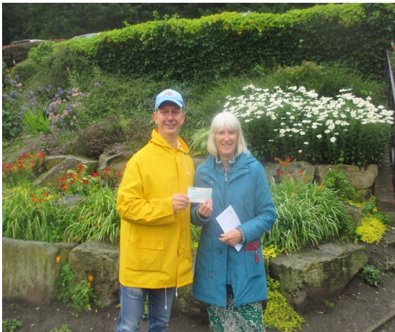
Cheque presentation to RNLI Mirfield branch