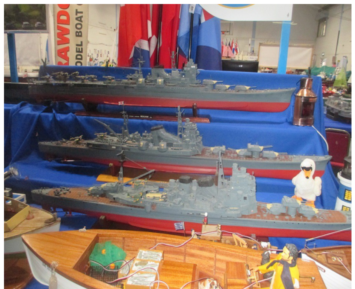
Roger Shepherd's Japanese Cruisers