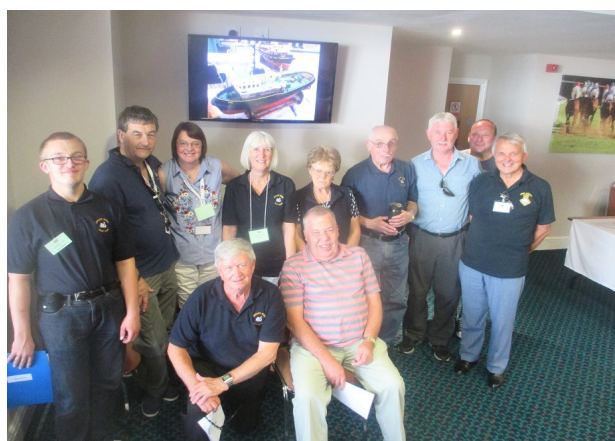
Most of the team at Haydock