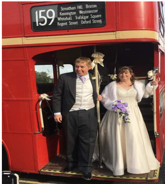
The happy couple