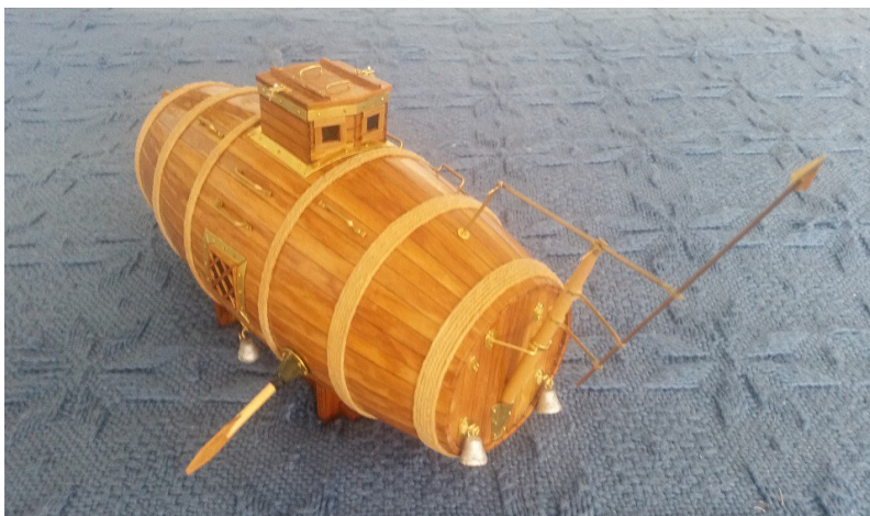
Lionel Broadbent's non-working submarine