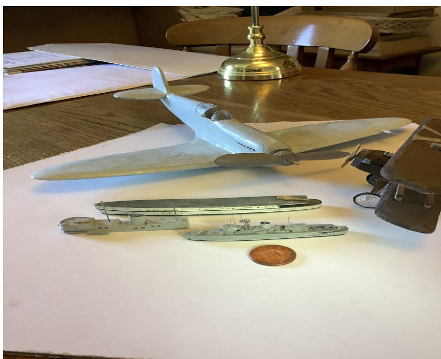
Charles Vidal's Spitfire