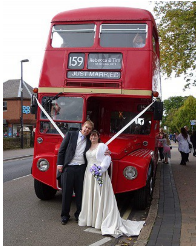
This is not a Rolls Royce!