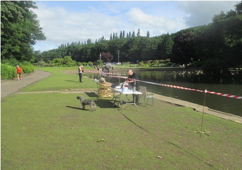
Early 1st day back at the Park