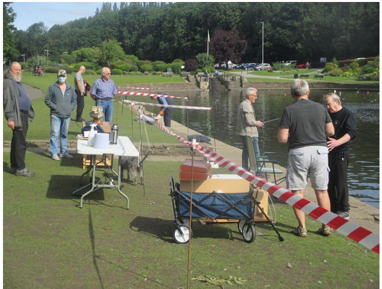
Members enjoying first day back