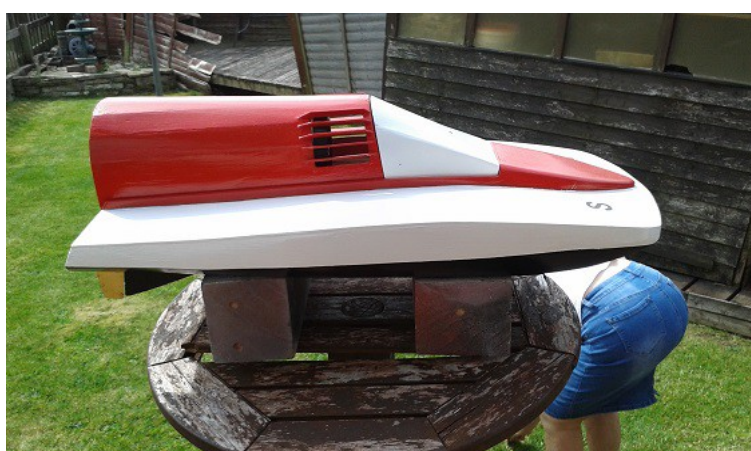
Willie Crowher's experimental boat (plus bottom!)