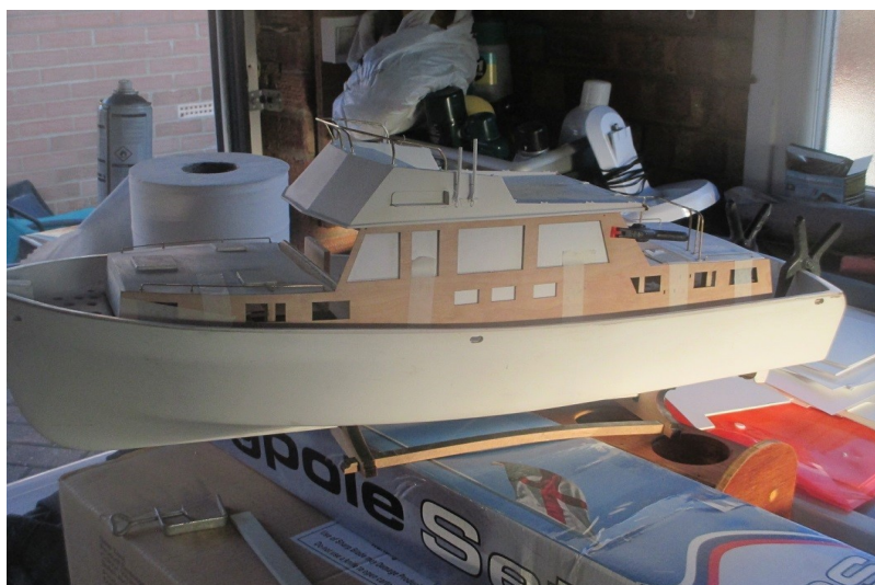
Stan Reffin's Grand Banks 46' luxury yacht