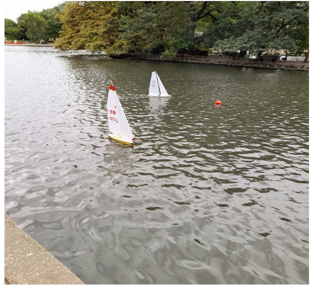
Yachts in The George sail race