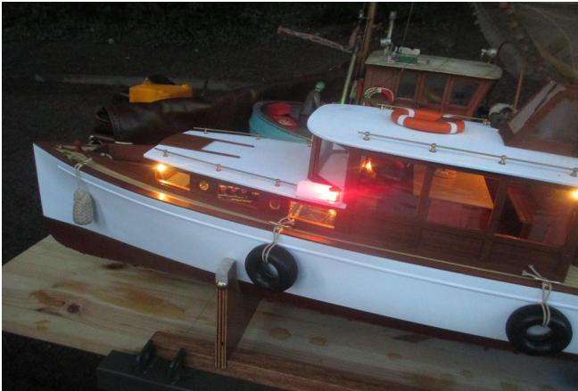
one model illuminated before going in the water

Report on Nigh Sail Wednesday 7 th September – 13 members attended on a night which cleared after a thunderstorm. 2 yachts looked very impressive with LED light strung down the masts. Some very nice scale models which also looked very nice lit up.