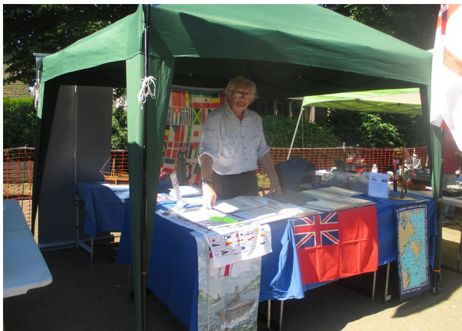
Some models seen on the day and Scale Flags' stand.