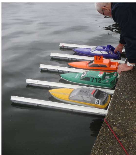
The last 4 of the Club 500 series